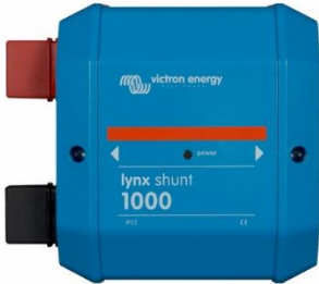
Lynx Shunt VE.Can