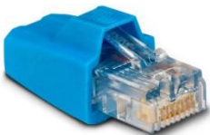
RJ45 VE.Can terminator