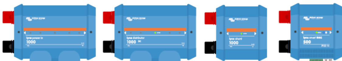
The Lynx modules: Lynx Power In, Lynx Distributor, Lynx Shunt VE.Can and Lynx Smart BMS