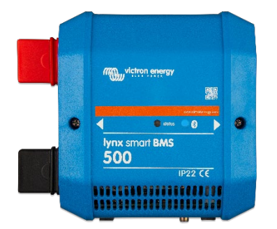
Lynx Smart BMS