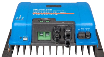
SmartSolar Charge Controller MPPT 250/70-MC4 without display