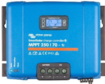
SmartSolar Charge Controller MPPT 250/70-Tr with optional pluggable display