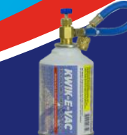
Line Set Flushing Kit